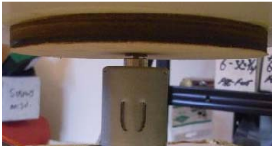
Wood disk glued to motor

Let all parts dry completely and set aside.