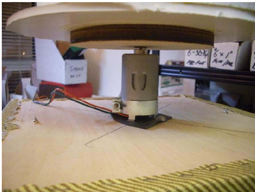
Motor, Wood Disk and Foam Cone Assembly

You are almost there, looks like a good time for a beer! Coke?