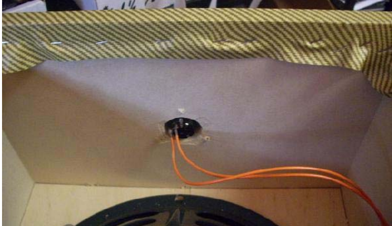
Interior view of wiring to speed control pot