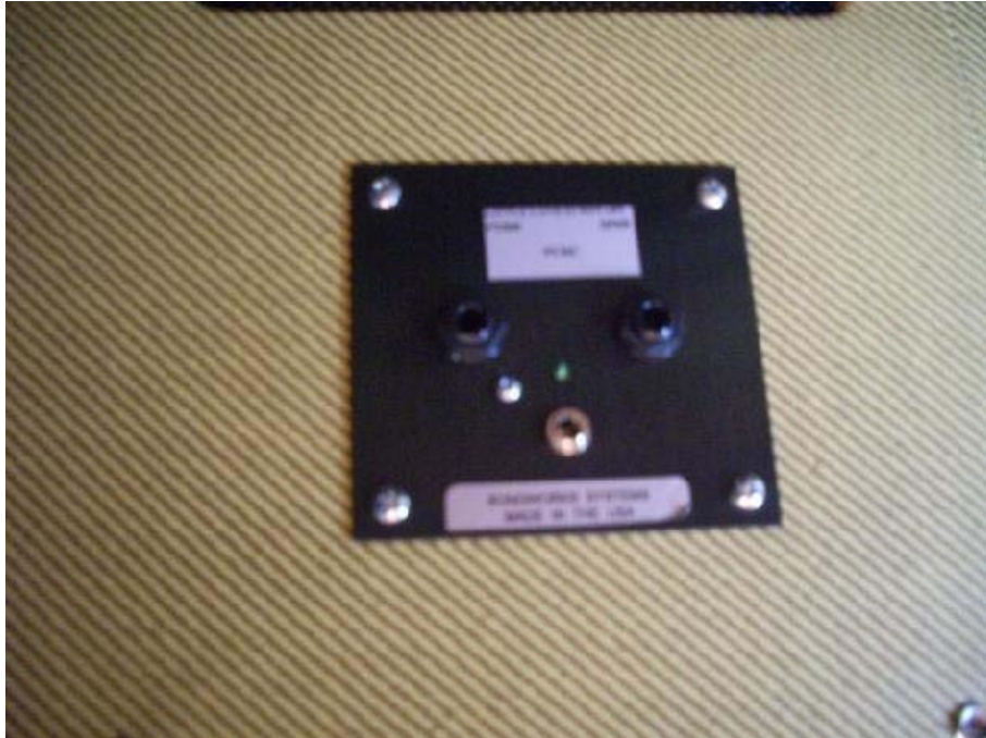
Exterior View of Speaker, Footswitch and Power Supply Jack Panel