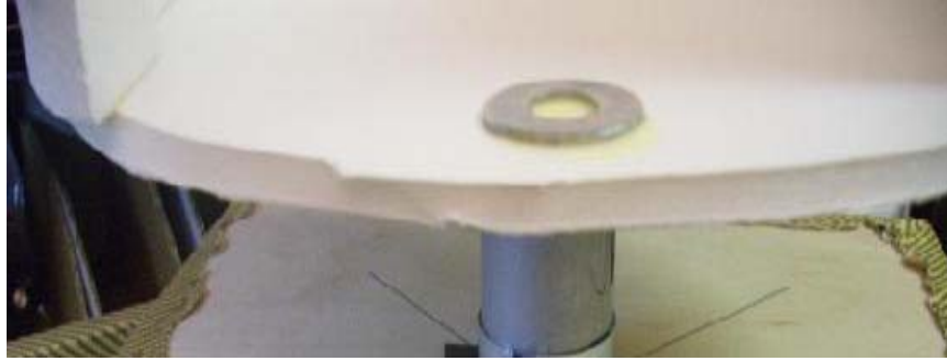
Interior of Foam Cone with steel washer